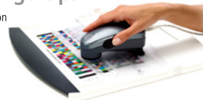
i1Pro and Scanning Ruler

i1Pro solutions are designed for the unique needs of creative and prepress professionals who depend on accurate color throughout their workflow. Whether you are a fine art photographer, graphic design producer or prepress professional, i1XTreme is the one system comprehensive enough to be the only color management solution you will ever need. i1XTreme includes the defacto industry standard i1Pro spectrophotometer and i1Match profiling software. Obtain accurate color on all your devices in your digital workflow.